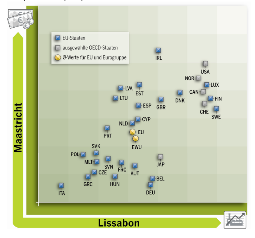
Diagram: Goal attainment in the two EU economic policy goal dimensions.

The unanimous goal of the EU member states is to make the European Union dynamic in economic and stable in finance policy terms. For this reason indicators were selected for the two-dimensional LiMa benchmark which are of significance for the long-term growth potential (Lisbon) and fiscal sustainability (Maastricht). Thus the results of the LiMa benchmark coincide with neither the current growth predictions for the EU economies nor the attainment of the stability and growth pact criteria, but possess a medium to long-term prediction perspective.