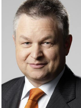
Michael Georg Link is a Member of the German Bundestag and Minister of State at the Federal Foreign Office.