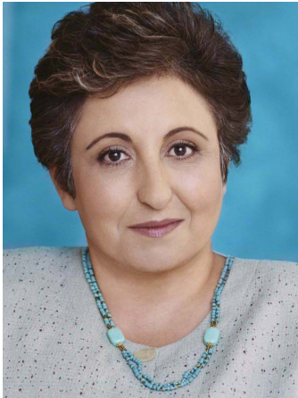
Dr Shirin Ebadi received the Nobel Peace Prize in 2003. She is an Iranian lawyer and human rights activist.

11.30 a.m. PANEL DISCUSSION EUROPE AS A COMMUNITY OF SHARED VALUES: WHAT DO WE STAND FOR?