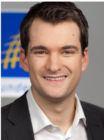
Johannes Vogel is a Member of the German Bundestag for the FDP parliamentary group.