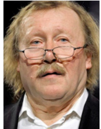
Prof. Peter Sloterdijk is a writer and philosopher. He is Rector and Professor of Philosophy and Aesthetics at Karlsruhe University of Arts and Design.