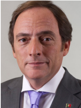
Dr Paulo Portas is Minister of Foreign Affairs of the Portuguese Republic.