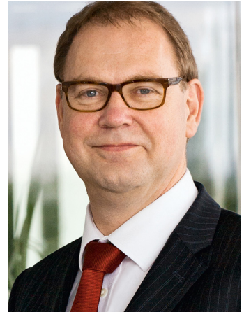
Chair Aart De Geus Chairman and CEO of the Bertelsmann Foundation. Prior to taking up this post, he was Deputy Secretary-General of the Organisation for Economic Co-operation and Develop- ment (OECD) and Minister of Social Affairs and Employ- ment of the Netherlands.