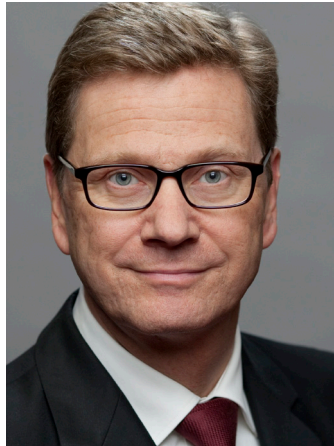
Dr Guido Westerwelle is a Member of the German Bundestag and Federal Minis- ter for Foreign Affairs.